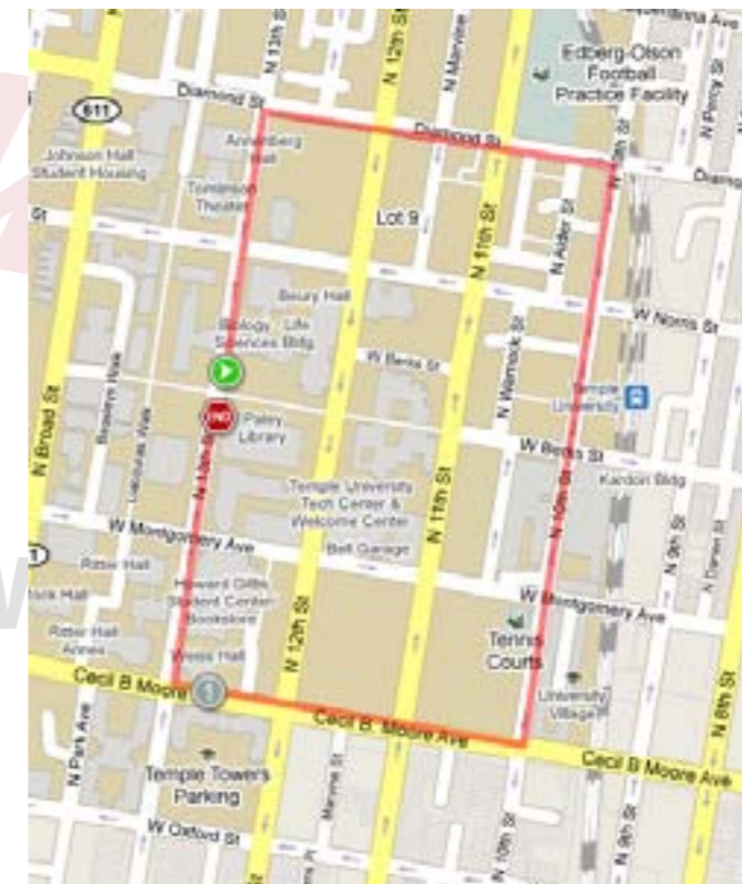
PROPOSED '11 TEMPLE COURSE